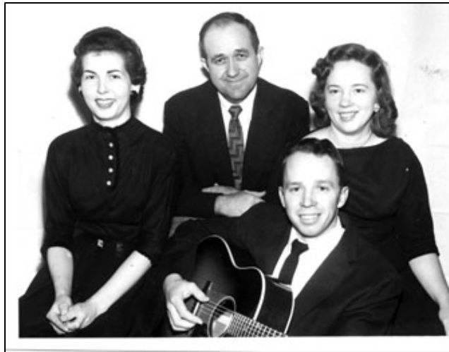
The Cash Quartet (ca. 1958)

They are one of the many amateur gospel groups that were an integral part of Kentucky's local music culture and thriving gospel scene during the twentieth century who were not interested in commercial recording. Fortunately, a few recorded performances survive on some of the Gatherin' shows that have been preserved in the Berea College Sound Archives. In addition, three of the four members still live in Rockcastle County along with the wife of the only deceased member, and they were all able to provide a wonderful account of the Cash Quartet's genesis and life.