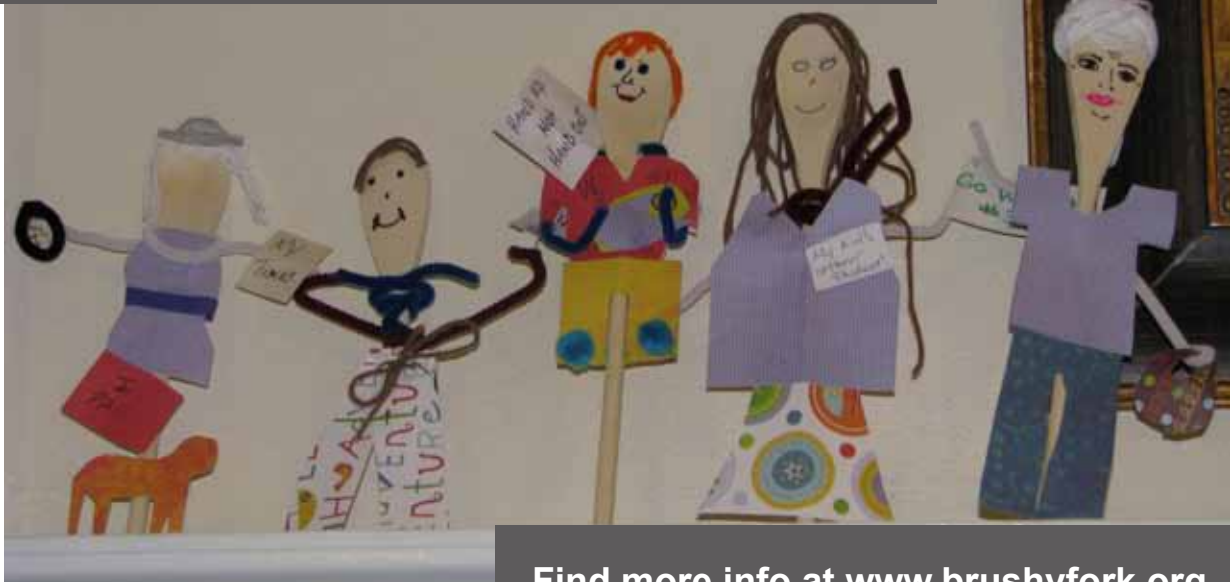
spoons of "our audience" from Anne Durham's Tools for Promoting Your Program or Issue track

Find more info at www.brushyfork.org or call 859-985-3858 today.