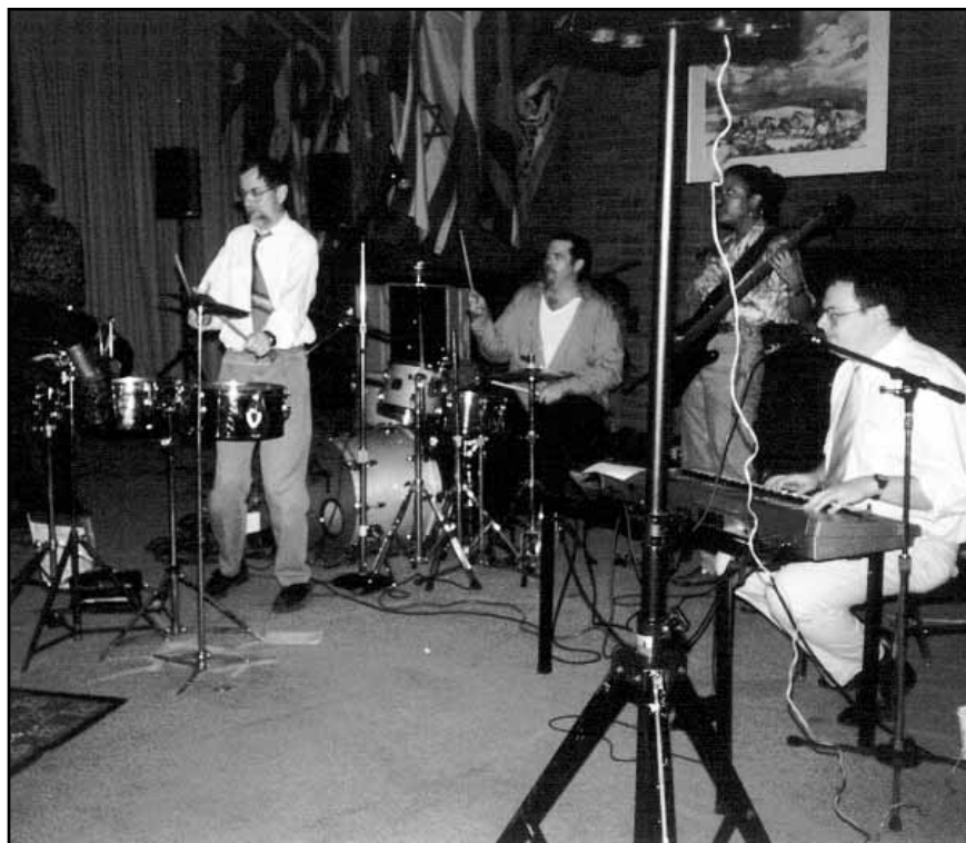
Carribbean Conspiracy jamming out at the Copasetic Coffeehouse.