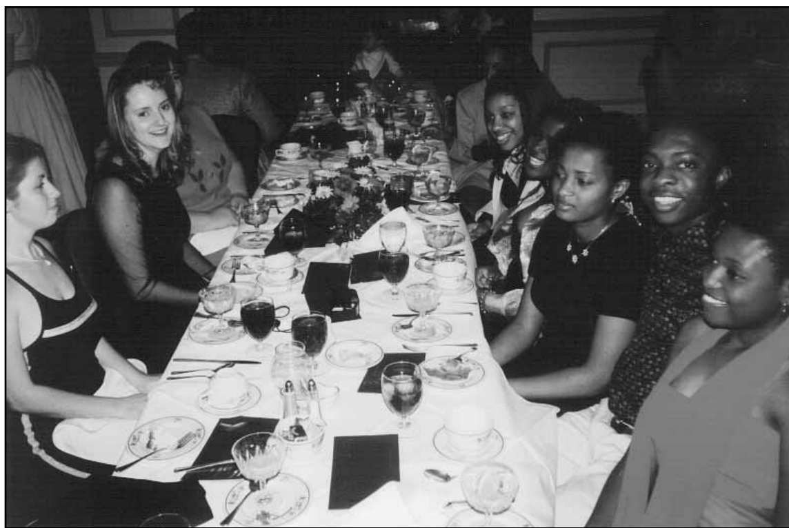
Students at the Unity Banquet: "where's the food?"

This year's Black History Month was truly a diverse experience, highlighting just a portion of the beauty and strength of the black experience.