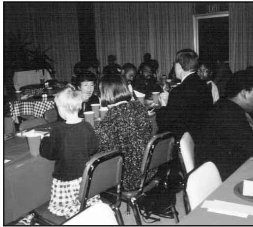
The big feast at the Kwanzaa Celebration.

The Black Cultural Center, along with student organizations, planned the celebration which took place in December in the Snack Bar of the Alumni Building. People in attendance had the opportunity to hear students, staff and faculty recite the Nguzo Saba (Seven Principles). The principles represent the ideas of unity, self-determination, collective work, cooperation, purpose, creativity and faith.