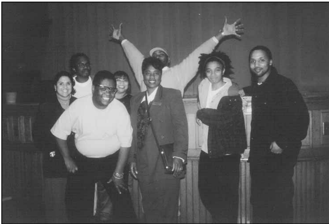
Our Young Black Men actors and BCC staff gather at the stage after the show.

Cultural Research Center at the University of Cincinnati. He is also the originator of the nationally recognized, Black Man Think Tank. The event ended with a performance by 4U, one of Louisville's most sought-after jazz and R&B bands.