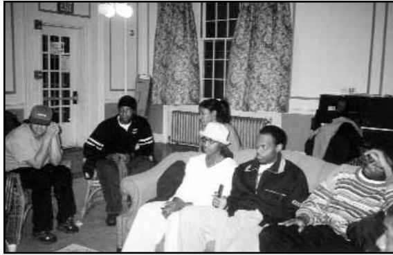
Students participate in a lively discussion on love, relationships, and sexuality.

On November 17, sixteen students gathered to take their First Lesson: Relationships 101. Seven males and nine females discussed their ideas about what makes a relationship meaningful, productive, and most