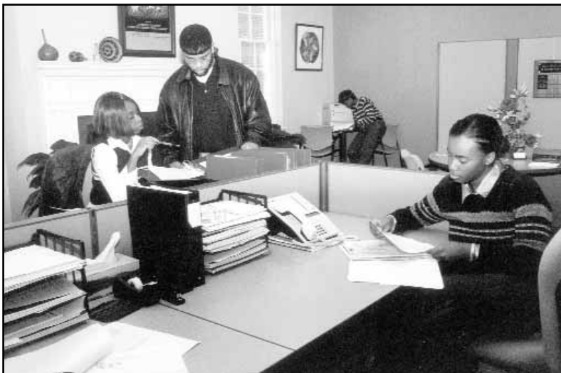
Black Cultural Center staff hard at work in their new home in Woods-Penniman.